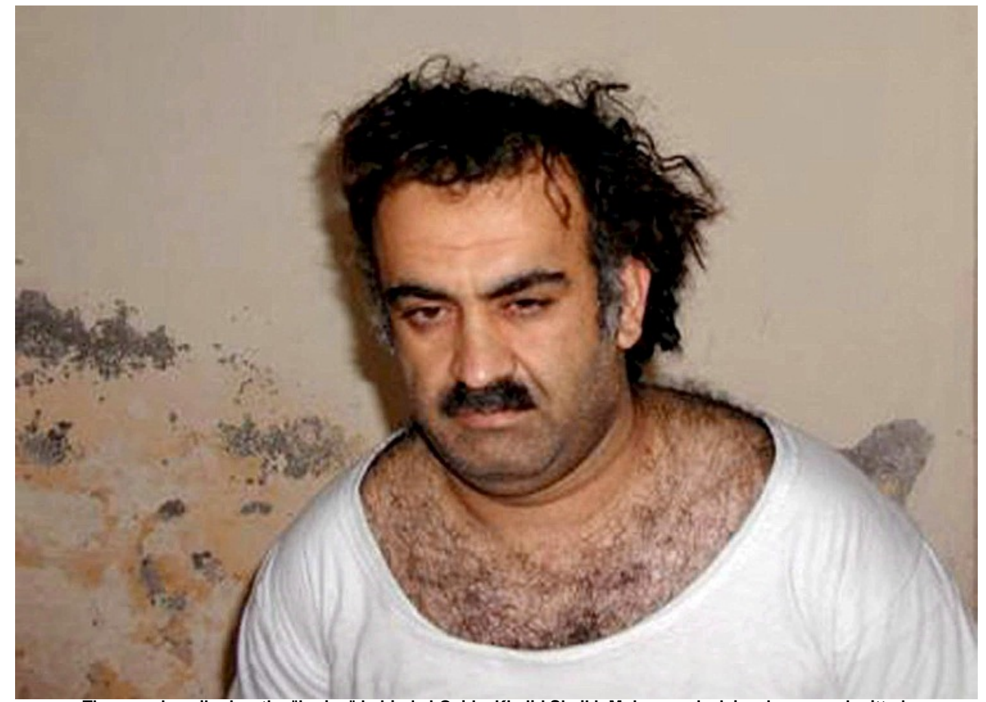
The man described as the "brains" behind al-Qaida, Khalid Sheikh Mohammed, claims he was submitted to waterboarding 183 times over a one-month period. New evidence suggests the interrogation took place in Poland.