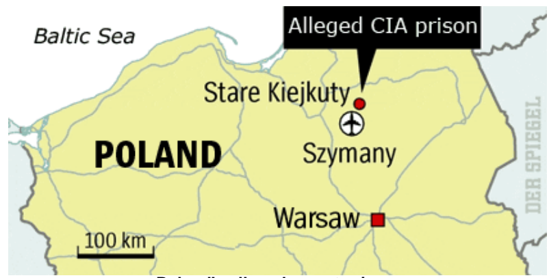
Poland's alleged secret prison.